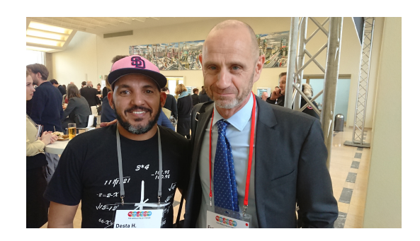
Figure 3: Me and Evan Davis, Presenter of BBC Radio 4\,