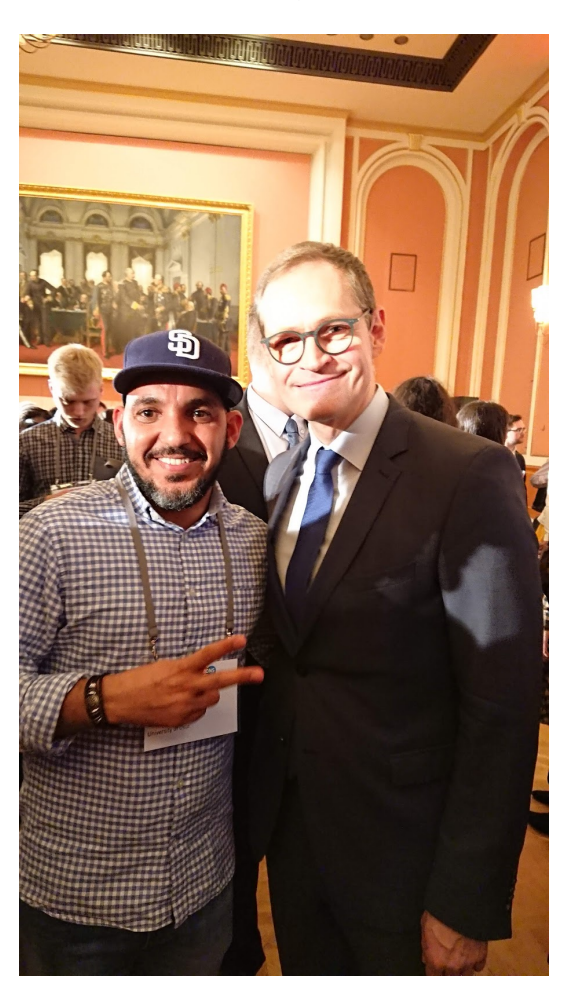
Figure 4: . Me and the Governing Mayor of Berlin, Michael Müller \,