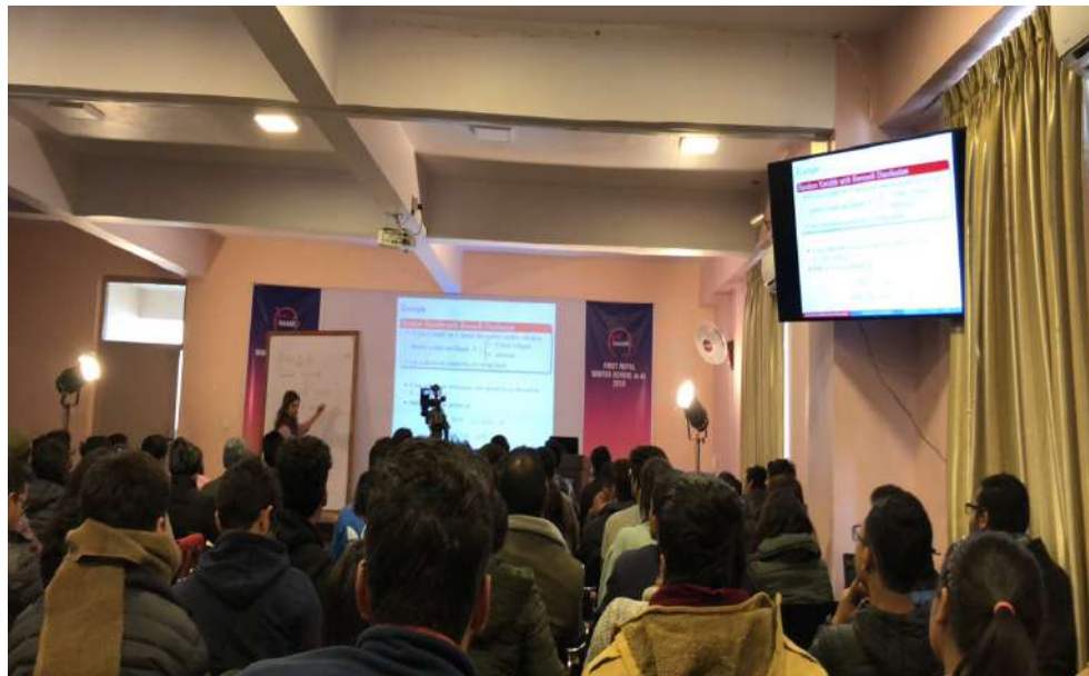
Fig. 2. Class atmosphere at the 2018 First Nepal Winter School in AI

I am thankful to the COINS for granting me travel support, that provided me with an opportunity to attend this winter school, where I learned from the distinguished speakers, gained valuable experiences, and also got chance to meet few research scholars from the same background.