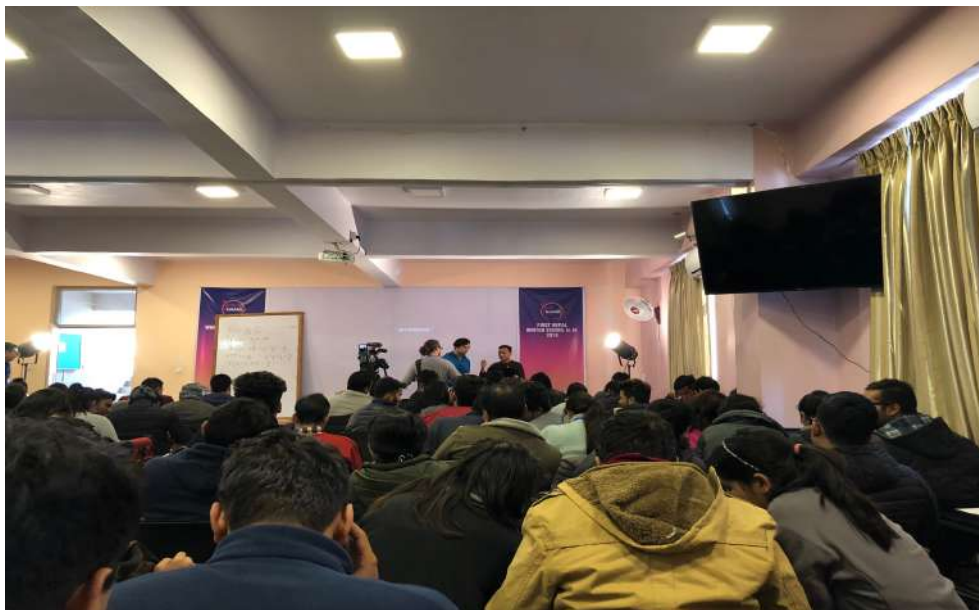
Fig. 6. Discussion session