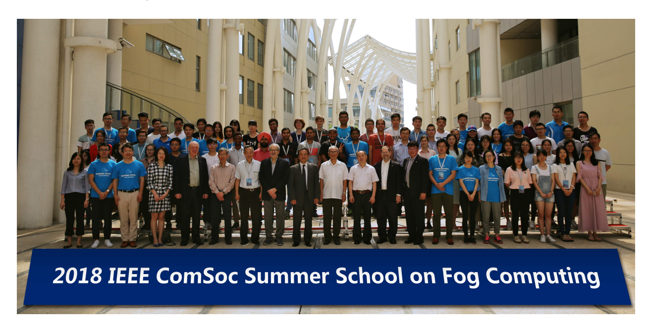
Figure 1.1: 2018 IEEE ComSoc Summer School on Fog Computing, group photo with all the participants and invited speakers

This is a summary of my travel report to Shanghai for the 2018 OpenFog Hackathon on Fog Computing. The OpenFog Hackathon is a part of the 2018 IEEE ComSoc Summer School on Fog Computing which was held in the city of Shanghai, on ShanghaiTech University campus, from June 26 to 29, 2018.