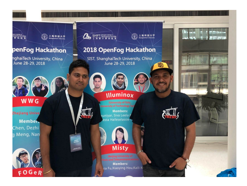
Figure 1.4: 2018 IEEE ComSoc Hackathon On Fog Computing, COINS Members