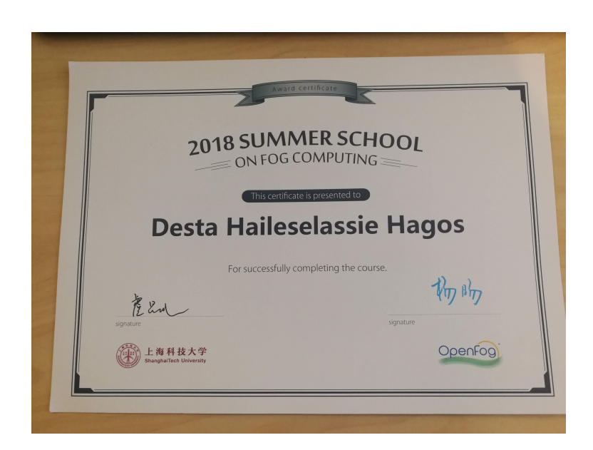
Figure 1.3: 2018 Summer School On Fog Computing, Certificate

The Hackathon on Fog Computing too was hosted by ShanghaiTech University. During the Hackathon, all teams were collaborating so as to build a project focused on Fog Computing from start to finish. The experience of the Hackathon was an invaluable opportunity for all the participating teams in terms of collaboration and coding experience in fog computing. Here under is a photo of me along with my team members during the Hackathon.