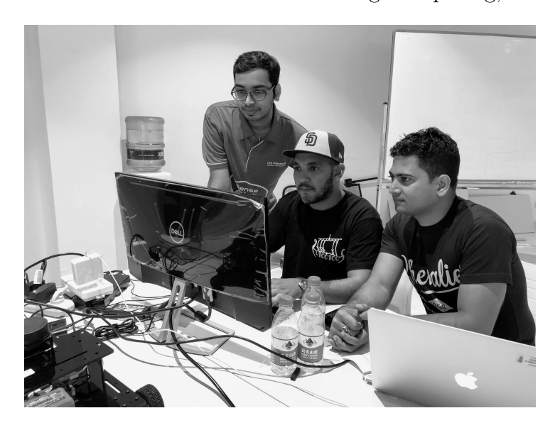
Figure 1.5: 2018 IEEE ComSoc Hackathon On Fog Computing, the Illuminox Team

As it is shown in the photos below, we have introduced our COINS project to the participants of the summer school in Shanghai. We have also made networking with some of the participants of the summer school which we believe will improve the visibility of our COINS project. After introducing what COINS Research School of Computer and Information Security is all about, we have invited some of the researchers to take part in some of our COINS Research School activities. In addition to that, we have also discussed our PhD research ideas with the invited speakers from the Open Fog Consortium.