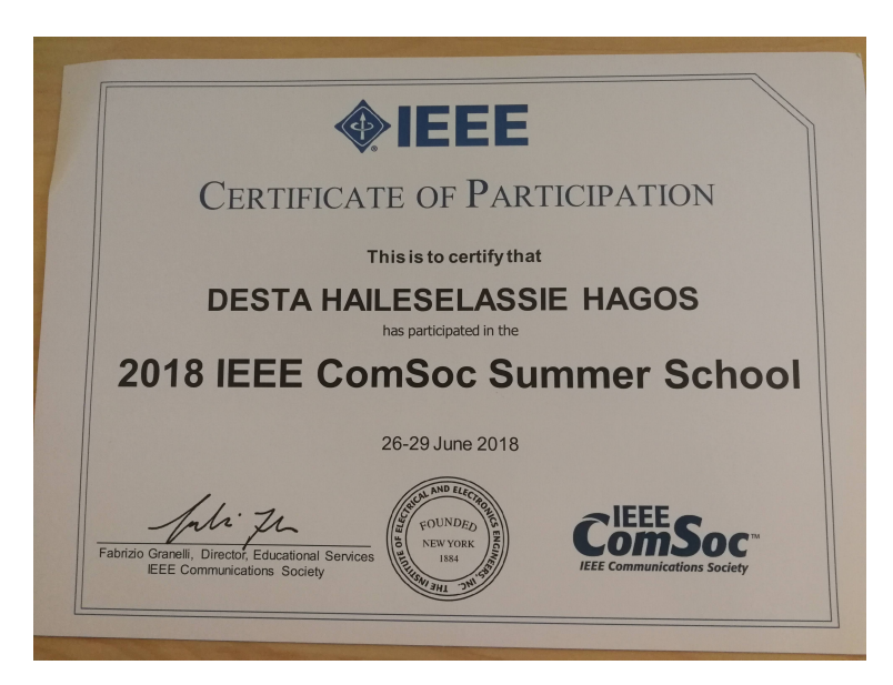
Figure 1.2: 2018 IEEE ComSoc Summer School, Certificate

different university research groups and industry partners. Here under are the certificates of participation I receive.